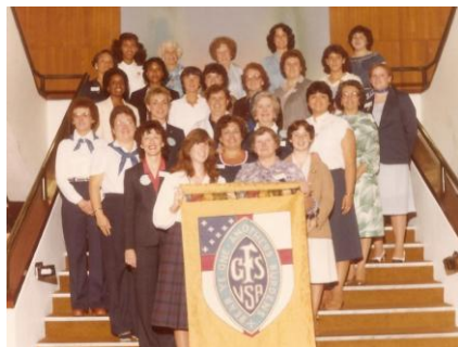
USA delegation to World Council

determination and dedication of this committee resulted in the unification of the National Board of Directors and the National coordinating Board as one Executive and Legislative Board of GFS/USA. On March 31, 1979, a Declaration of Unification was signed containing the same definition of GFS as in 1877. This act re-established GFS/USA National Assembly and made it possible for the organization to once again participate in the international GFS World Council.