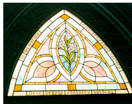
Girls Friendly Society Window at St. Anne's Parish, Lowell Massachusetts