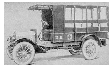
Early Red Cross Ambulance

During its early years, GFS established homes and centers for young workingwomen. Through close ties with the Chaplain of the Port of New York, immigrant women arriving in America received job and housing assistance. GFS assisted in forming the Traveler's Aid Society in 1887 and began making systematic reports to the General Convention of the Episcopal Church in 1895.