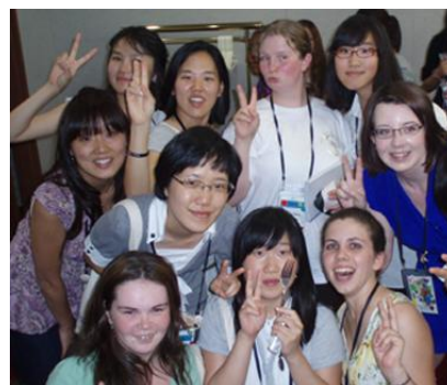
World Council attendees in Seoul, South Korea, August 2008

Today GFS diocesan and branch programs are meeting new challenges and continuing, through both tradition and change, to meet the needs of GFS members.