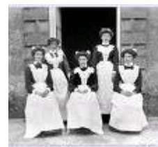
House servants, late 1800's