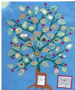
A Jesse Tree made from felt.