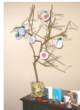
Paper symbols hung on a branch.