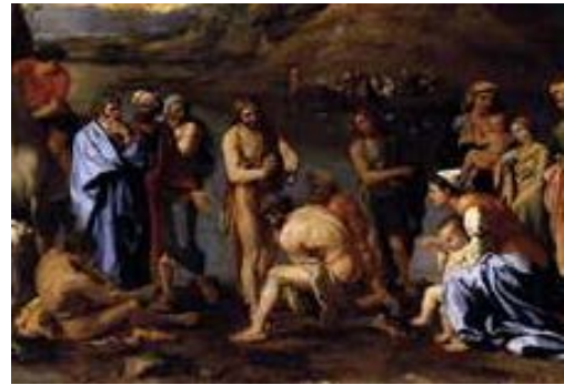
St. John the Baptist Baptizes the People by Nicolas Poussin, 1635. The Louvre Museum in Paris

People's hopes began to rise, and they began to wonder whether John perhaps might be the Messiah. So John said to all of them, "I baptize you with water, but someone is coming who is much greater than I am. I am not good enough even to untie his sandals. He will baptize you with the Holy Spirit and fire. He has his winnowing shovel with him, to thresh out all the grain and gather the wheat into his barn; but he will burn the chaff in a fire that never goes out."